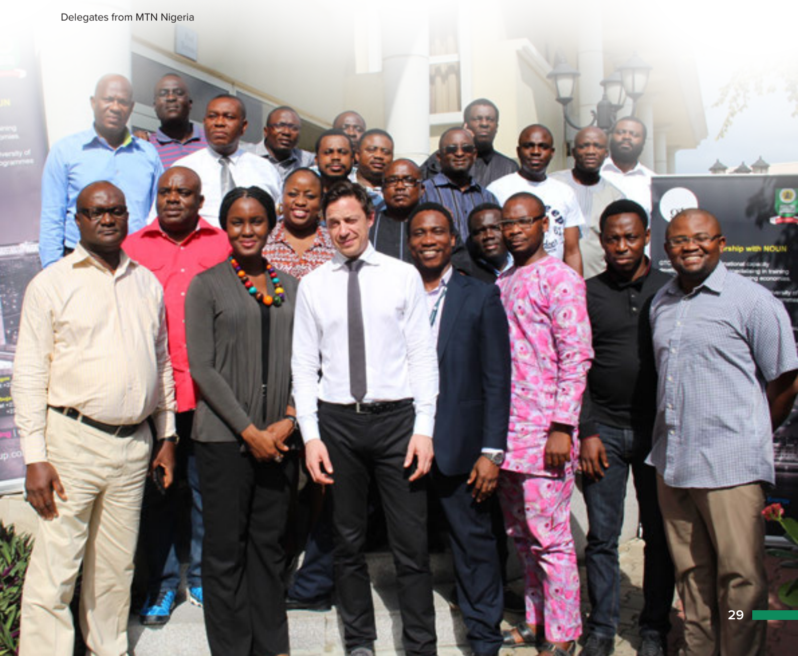
Delegates from MTN Nigeria