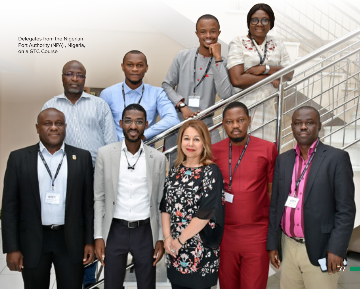
Delegates from the Nigerian Port Authority (NPA) , Nigeria, on a GTC Course