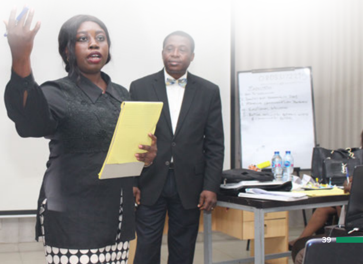
A delegate on a GTC course in Lagos making a presentation