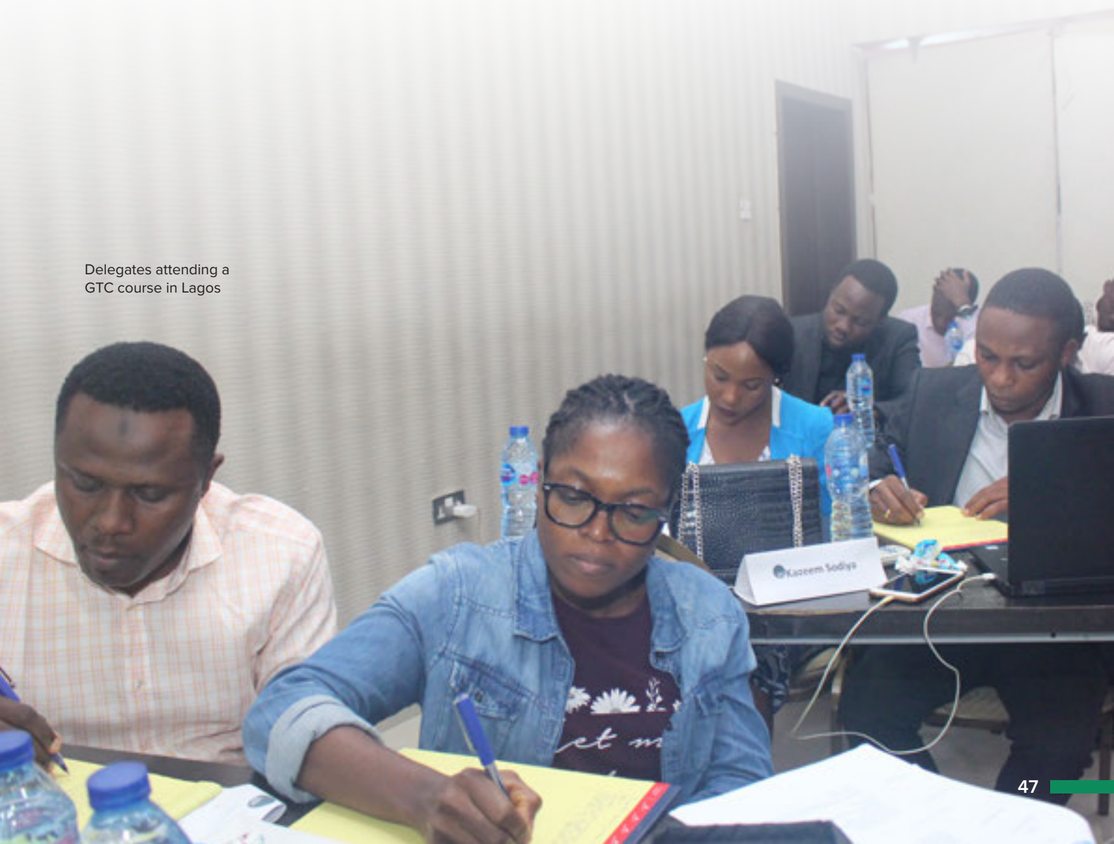
Delegates attending a GTC course in Lagos